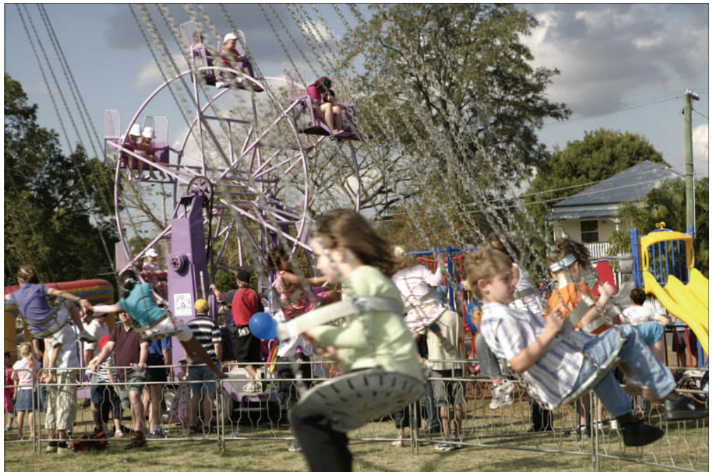
The ride of their lives ... a Graceville ride band is the best value ticket in town