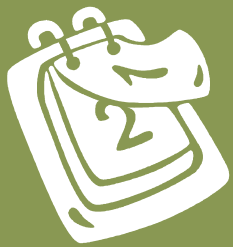
The fridge magnet